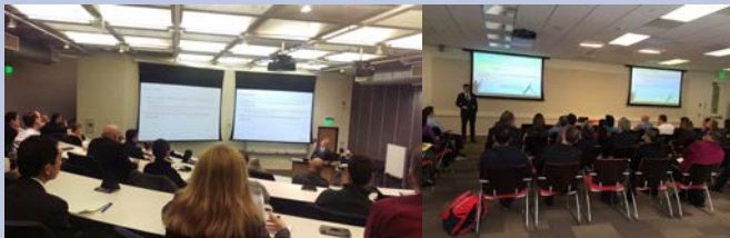
Top Left: February Cybersecurity Learning Event. Top Right: April Terrorist Financing Learning Event. Bottom Left: August Emerging Payment Technologies Learning Event. Bottom Right: November Learning Event where we highlighted the advanced certifications of a couple of our members.